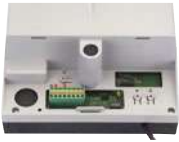
E600 electronic control unit incorporated Info at page 146